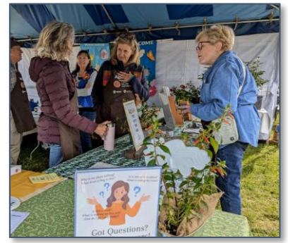
Ask a Master Gardener™