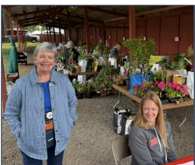
Raffle Prize Pick-up

See you at the Fair 😊 Saturday, May 2 from 9am to 5pm Sunday, May 3 from 9am to 4pm