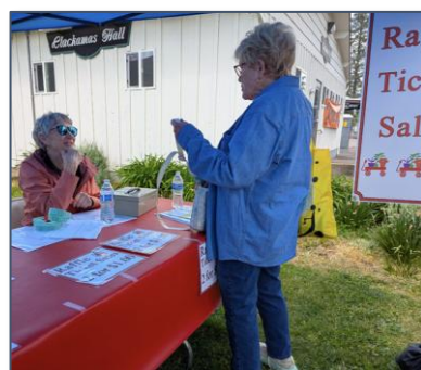
Raffle Ticket Sales