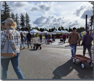
Gates open @ 9am