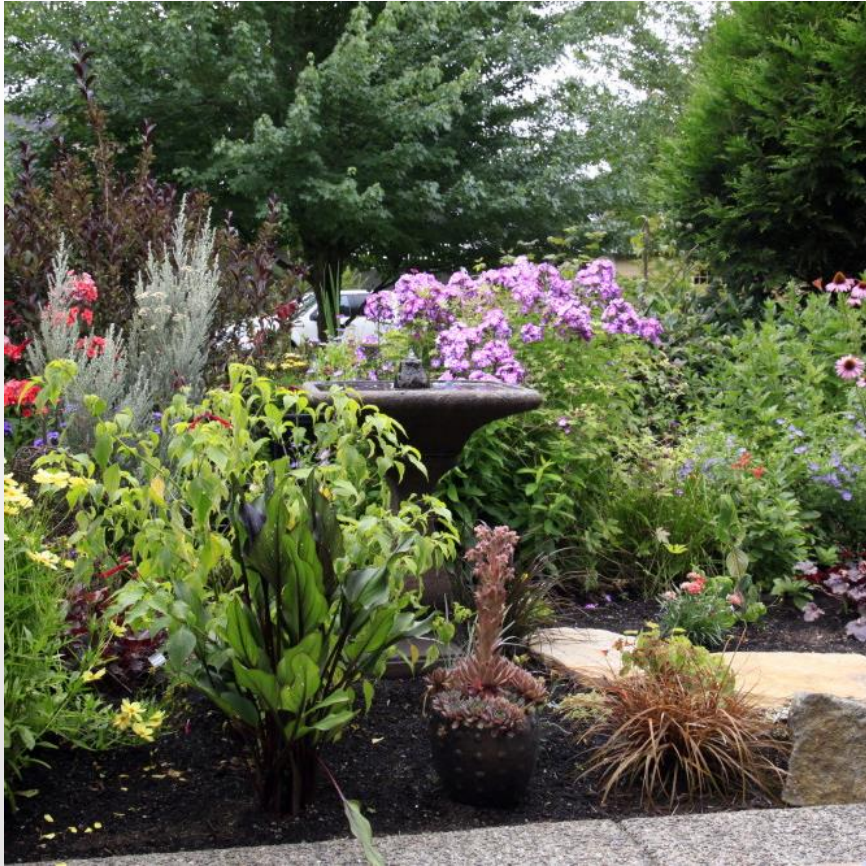
Laura Eyer's July Garden