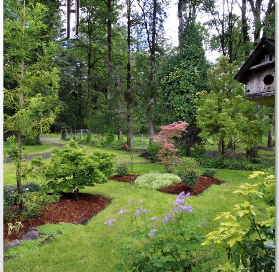
Peggy Cisco's May Garden