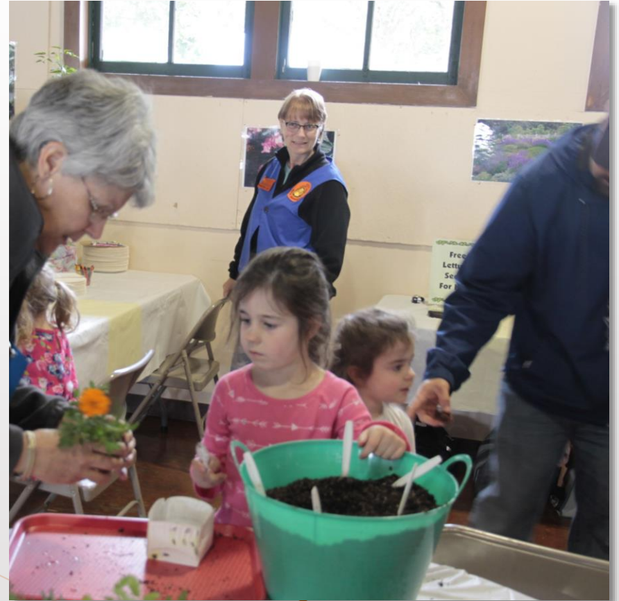
Exhibits Center and Children's Activities.