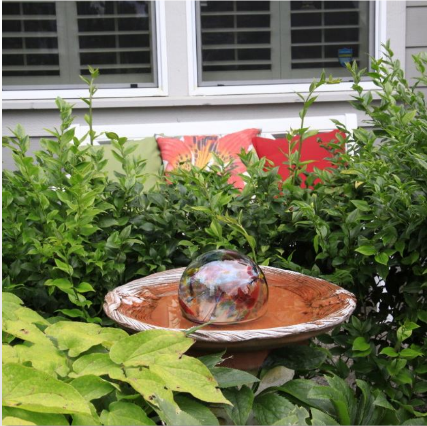
Laura Eyer's July Garden