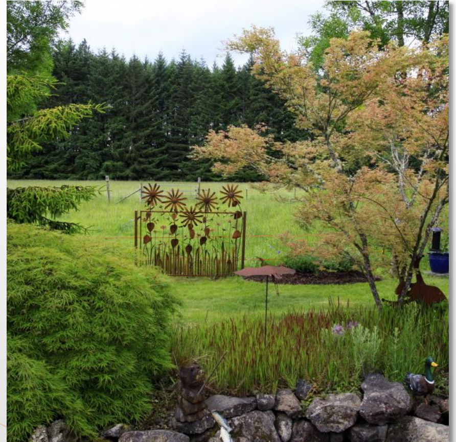
Peggy Cisco's May Garden